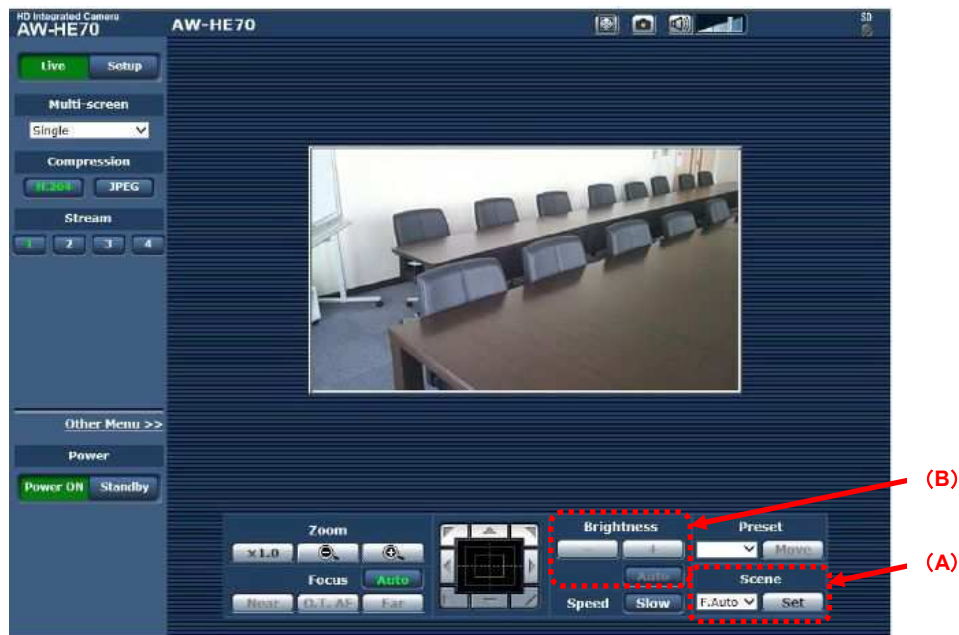
(Figure 2: Web Screen)

* For the connection between PC and AW-HE40, please refer to the Manual 【Controlling AW-HE40 Camera via PC】 .