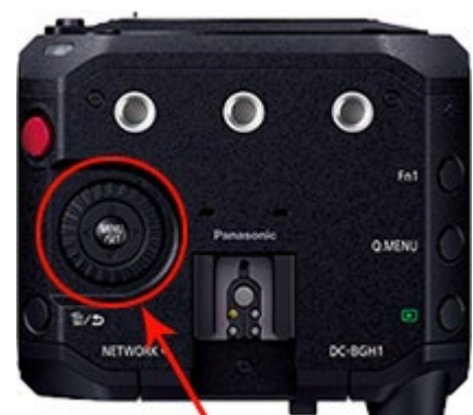
Location of MENU/SET and cursor buttons

Example of firmware update screen on the camera