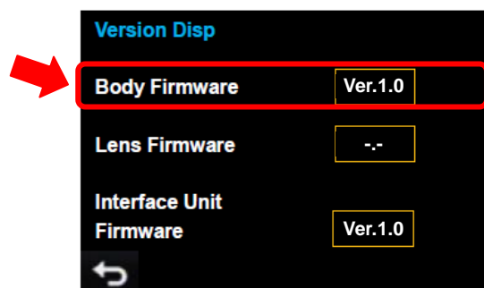
Version display example